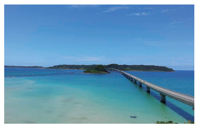
One of the leading contenders for the best scenic Japan, tsunoshima Island boasts spectacular beauty of its bridge. The bridge is 1,780m long and is free of charge to cross.