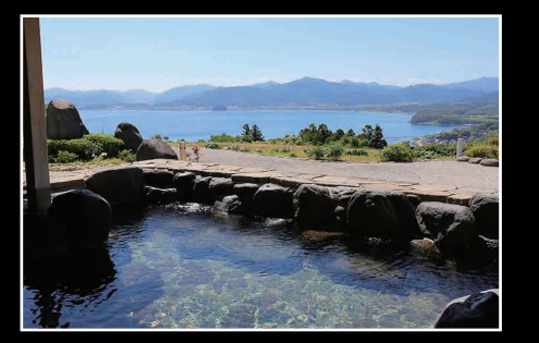
Kiwado Hot Springs