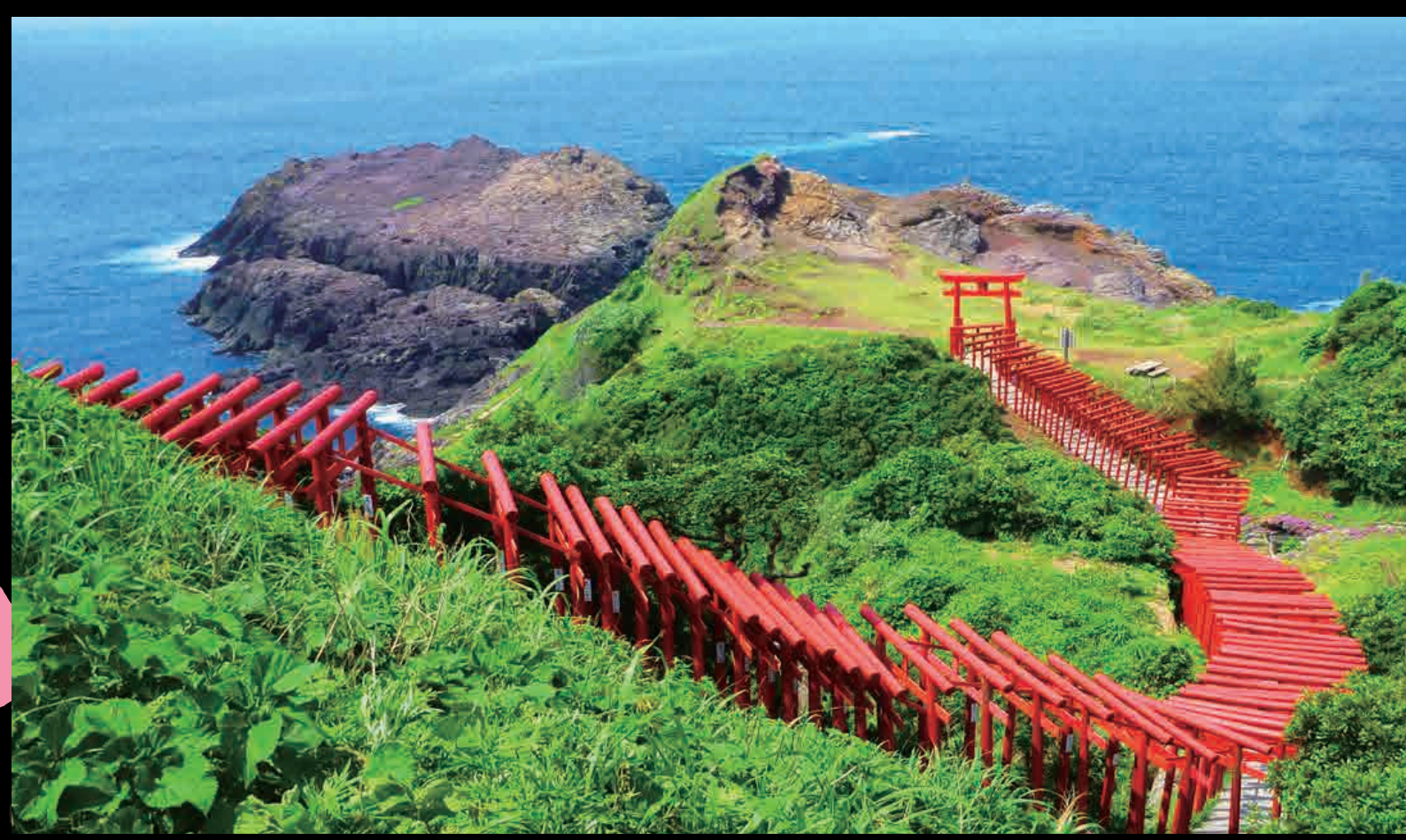
Motonosumi-Inari Jinja Shrine