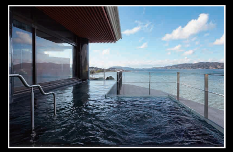
Yuyawan Hot Springs