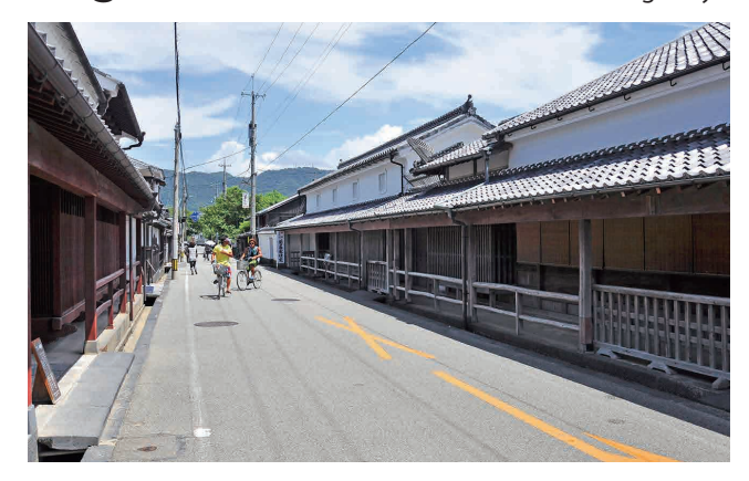
An historical area where the old cityscape of the Edo period still remains. Visitors can enjoy the area's alleys with earthen walls and the white grid-like patterns on black slate walls known as namako walls.