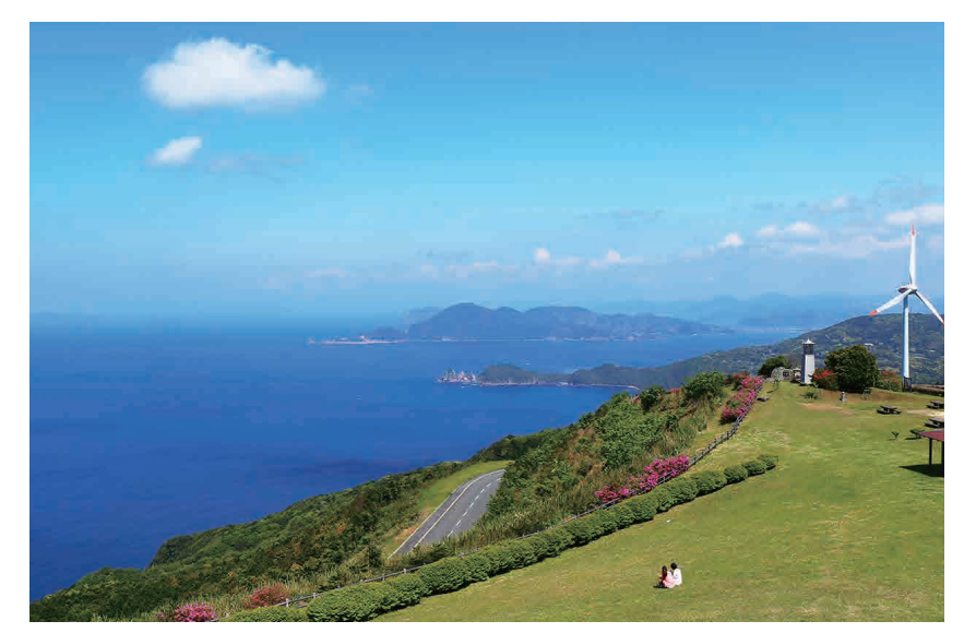
Senjojiki is grassland extending over the hill which stands 333 meters in height as high as Tokyo Tower, with islands in the Sea of Japan below. The 360-degree panoramic view of the blue sky is a view you do not want to miss along with the sound of the waves.