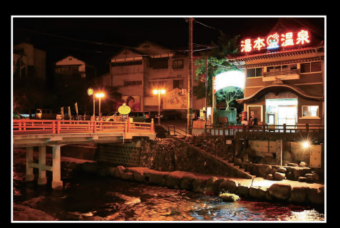
Yumoto Hot Springs